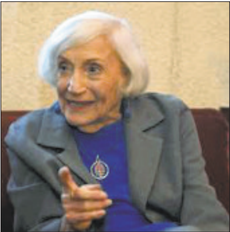
SPECIAL TO THE DAILY

Daily staff report newsroom@vaildaily.com